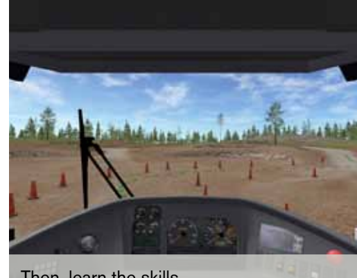
Then, learn the skills.