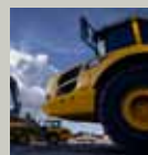
Volvo Construction Equipment