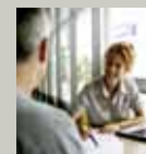
Volvo Financial Services