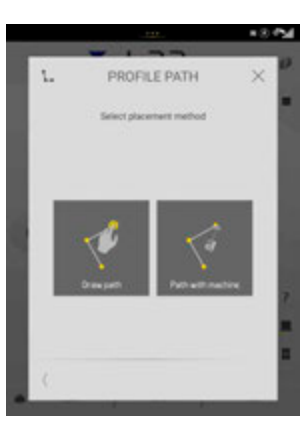
2. Create profile path