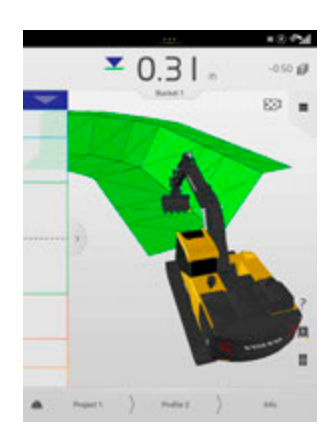
4. Get to work!