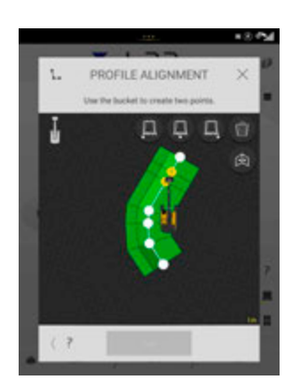
3. Align profile