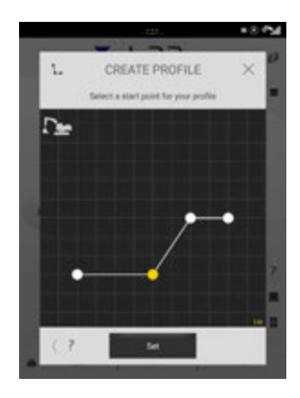
1. Create profile