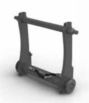
Volvo attachment bracket, P type. Available for: L20H/Electric, L25H/Electric

With many jobs requiring more than one attachment, Volvo provides you with a tool that turns your compact wheel loader into a real all-rounder. The ISO standardized attachment bracket enables the quick, easy and safe switching between attachments, at the touch of a button. Lock and unlock the attachment to the bracket without leaving your seat – all while benefitting from outstanding visibility.