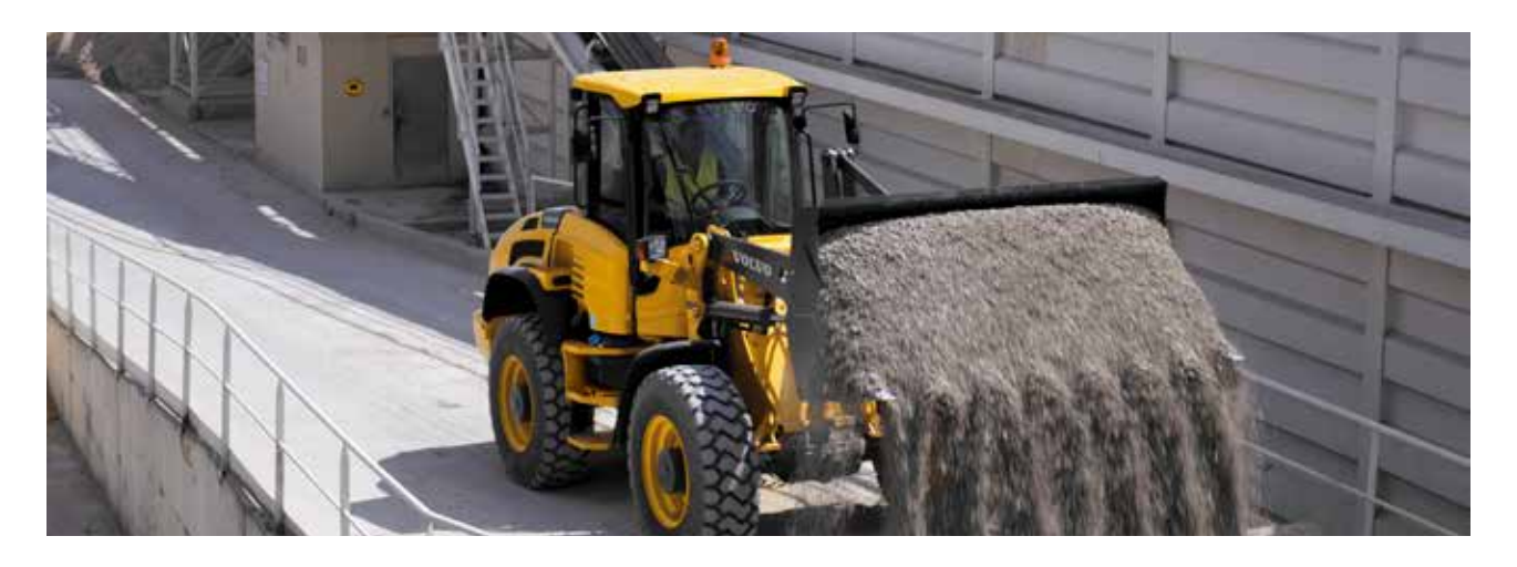
The bucket comes with welded adapters and teeth, or a pre-drilled cutting edge made from Hardox 400 steel. It can be equipped with a 1 or 3-piece bolt-on edge made from Hardox 400 as an option. Wear parts can be found on page 24.