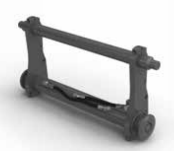
Volvo attachment bracket, Z type. Available for: L25 Electric, L30G, L35G