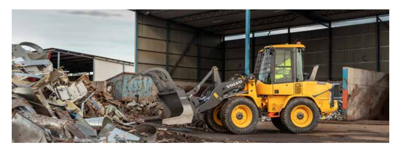
Wear parts can be found on page 24