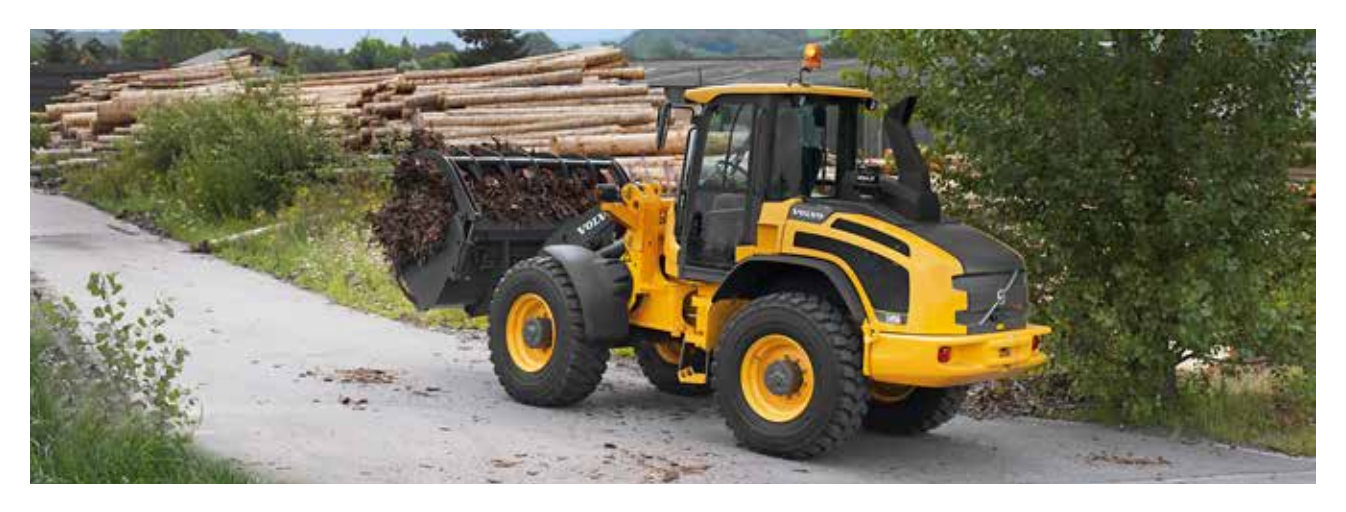
Wear parts can be found on page 24