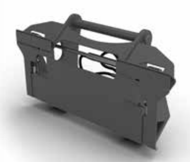
Volvo attachment bracket, SSL type. Available for: L20H/Electric, L25H/Electric, L30G