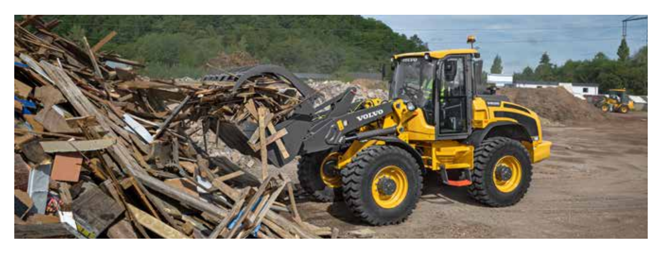
The bucket comes with a pre-drilled cutting edge made from Hardox 400 steel. It can be equipped with a 1 or 3-piece bolt-on edge made from Hardox 400 as an option. Wear parts can be found on page 24.