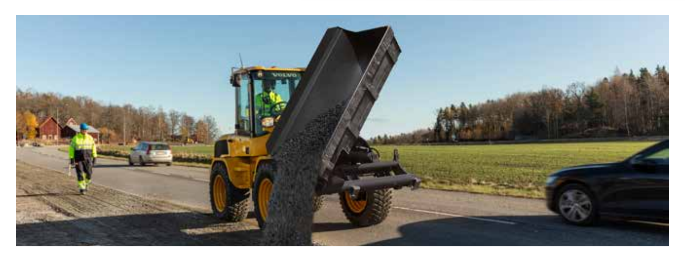
Wear parts can be found on page 24