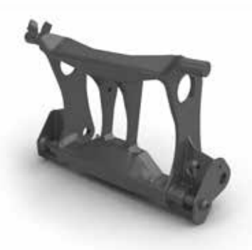
Volvo attachment bracket, TP-V type. Available for : L35G, L45H, L50H