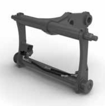
Volvo attachment bracket, TP-Z type. Available for. L35G, L45H