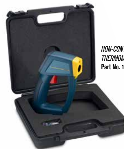
NON-CONTACT INFRARED THERMOMETER Part No. 15269785