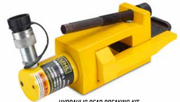
HYDRAULIC BEAD BREAKING KIT Part No. 15270392