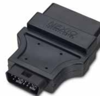
For use with CEC2 interface cable 15504416 Part No. 15275099