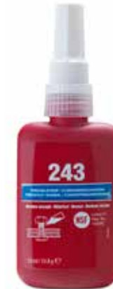
243 Part No. 9029849