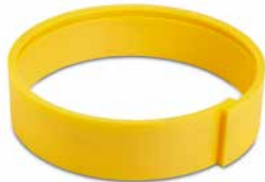
SEAL INSTALLATION TOOL Part No. 15269781