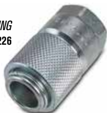
DIAGNOSTIC COUPLING Part No. 15018226