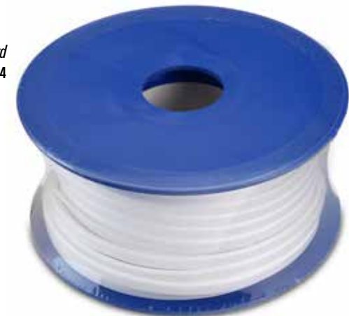
Sealant Cord Part No. 15234244