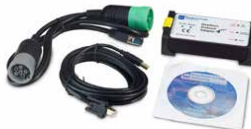
DOC VEHICLE INTERFACE KIT Part No. 15502615