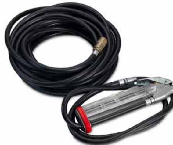
TYRE INFLATION KIT Part No. 15251192