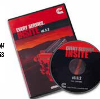
Insite Software CD-ROM Part No. 15501453