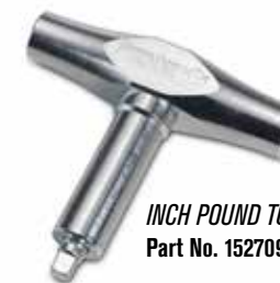
INCH POUND TORQUE WRENCH Part No. 15270981