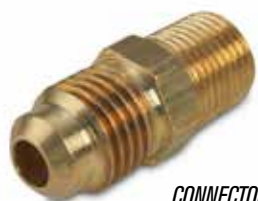
CONNECTOR (2 OFF) Part No. 118748