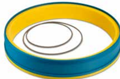
SEAL INSTALLATION KIT Part No. 15269783