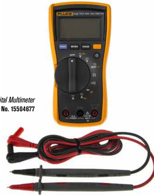
Digital Multimeter Part No. 15504677