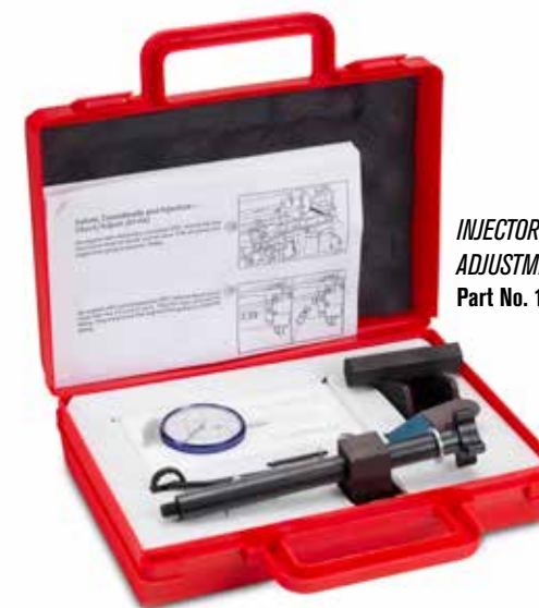
INJECTOR AND VALVE ADJUSTMENT KIT Part No. 15270983