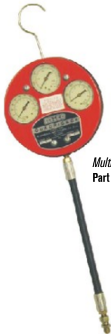
Multi Gauge Part No. 15269784