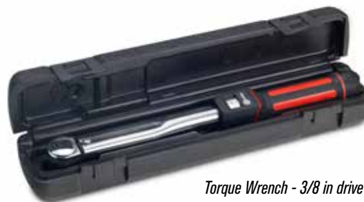
Torque Wrench - 3/8 in drive Part No. 15269861