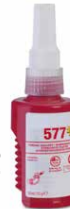
577 (Superflex) Part No. 15269106