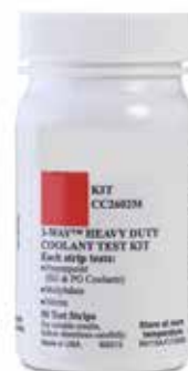
DCA4 TEST KIT - METRIC Part No. 15269814