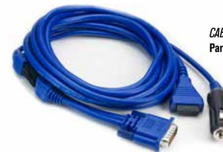
CABLE_ATARI 15 M Part No. 15504416