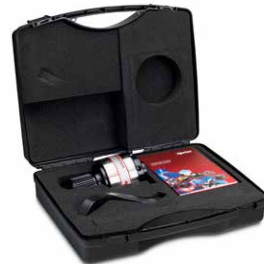
TORQUE MULTIPLIER - 1/2 IN TO 1 IN DRIVE Part No. 15269866