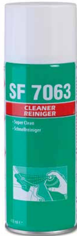
7063 Cleaning Agent Part No. 15305445