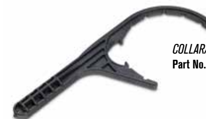
COLLAR/VENT CAP WREN Part No. 15503453