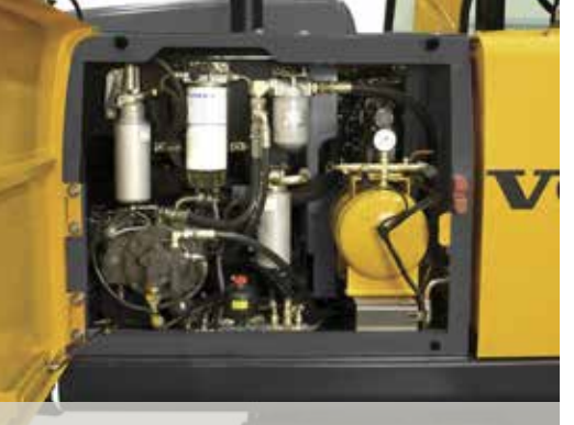
• Easy access for hydraulic pump filters.