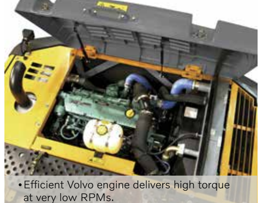
• Simplified, ground level service access.