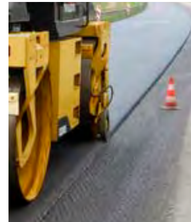
Outstanding performance: Volvo's precise electronic steering in action with the edge compactor attachment.

The Volvo DD85 and DD95 tandem vibrating rollers are specialists for asphalt compaction in construction of everything from small roads to highways. With the easy to operate electronic control system, they can be manoeuvred with exceptional sensitivity and precision. Drivers benefit from stable straight ahead travel, uniform cornering and the controlled offset operating mode. Thanks to the high amplitude, large layer thicknesses can be compacted with excellent result.