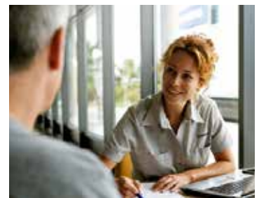
Volvo Financial Services