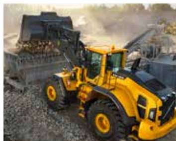
Volvo Construction Equipment