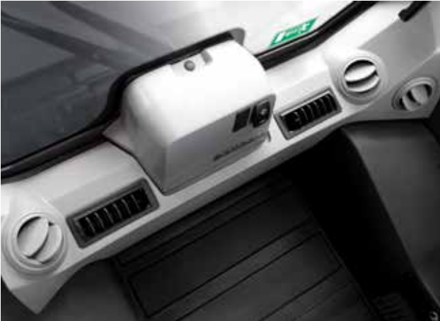
Heated cab with air conditioning