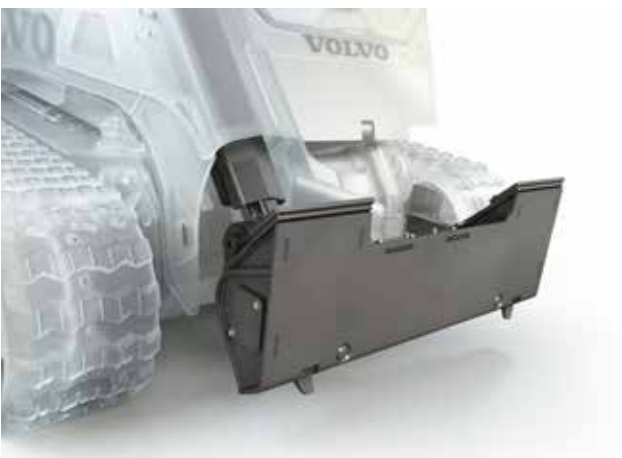
Volvo assisted attachment bracket