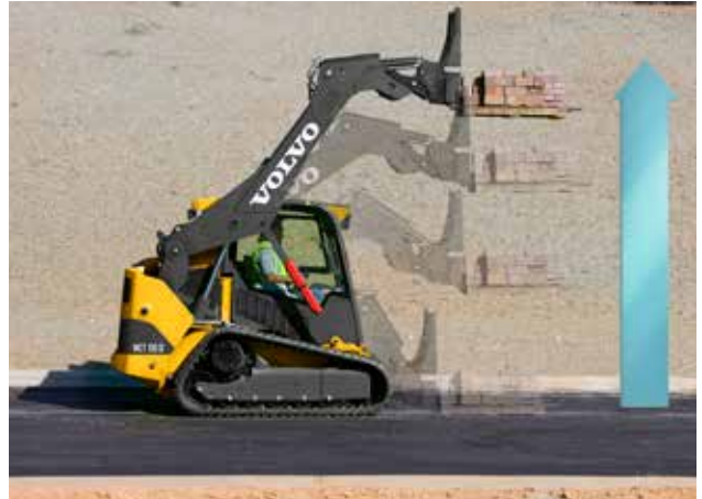
Parallel-Lift, raise only