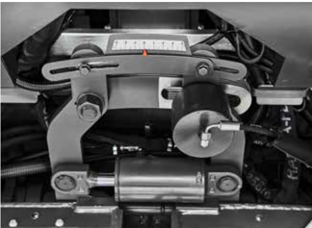
Hydraulic crown control