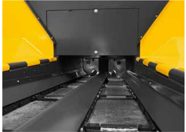
Choice of single or dual conveyor