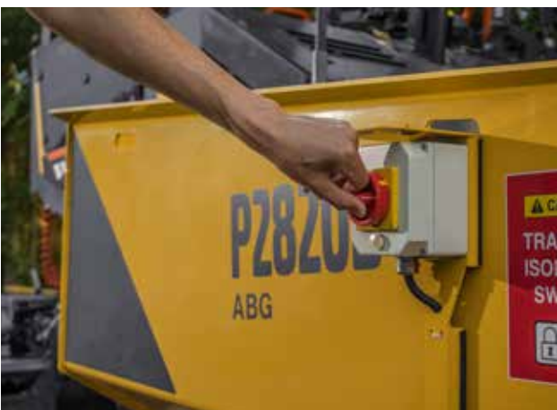
Lateral emergency switch