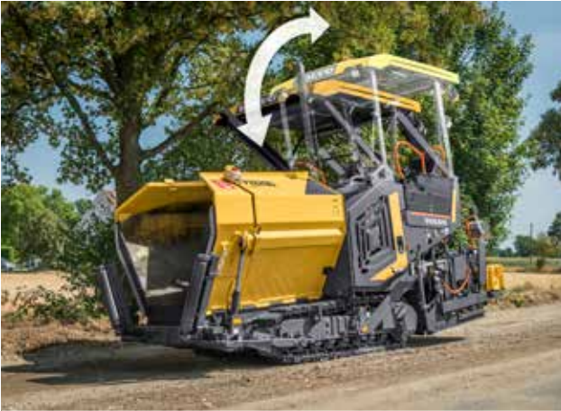
Electro-hydraulically foldable roof