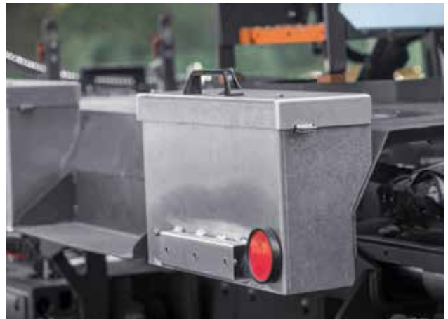
Storage area at screed level