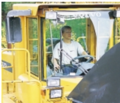
Care Cab II offers unparalleled all-round visibility.

Designed with the operator in mind Once you've comfortably positioned yourself in the multi-adjustable operator's seat, you'll soon discover why Care Cab II provides the best operator environment that money can buy. To your right, the hydraulic lever console can be adjusted to suit any operator. On the console itself, you'll find pilot-operated fingertip hydraulic levers for easy and precise boom/bucket control as well as controls for the APS II shifting system. All instrumentation is right in front of you on the center console of the new wrap-around dashboard. The three piece, silicon bonded front windshield provides excellent visibility to the front, while a new, larger rear window gives you a clear view.