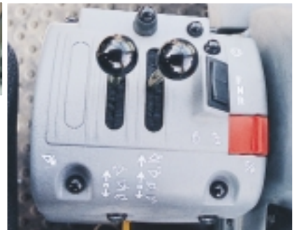
Pilot operated fingertip hydraulic levers provide easy control of the hydraulic functions. The adjustable hydraulic lever console also features a rocker switch for forward/reverse shifting and a 1 st gear kickdown button.

A full range of productivity boosting options, including Comfort Drive