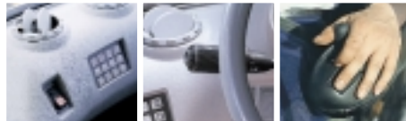
Left: Ten air outlets provide fresh filtered and climate-controlled air. The Contronic II control panel allows direct access to all major monitoring functions.

The Contronic II monitoring system continuously monitors all vital