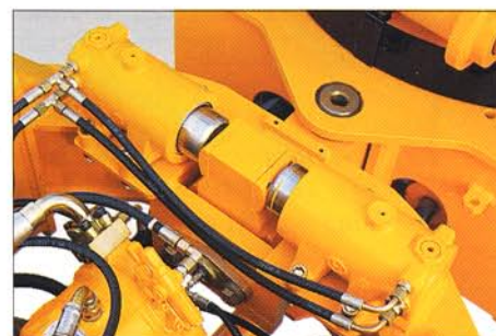
Chassis oscillation lock standard on 11CXi, optional on 11CX model.