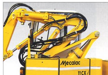
Optional hydraulic offset.