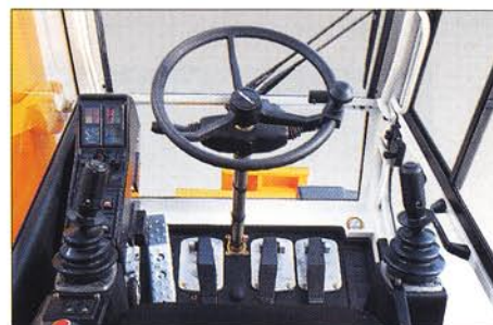
Rops and Fops cab, comfortable, sound-proofed, with excellent visibility.