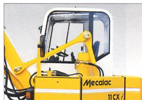
Boom ram with parallelogram frame ensuring variable throw.