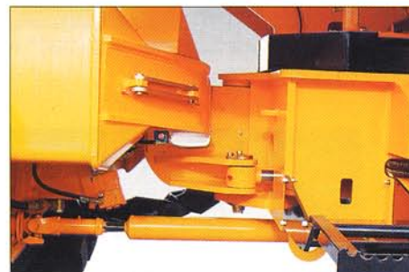
Articulated and oscillating chassis.