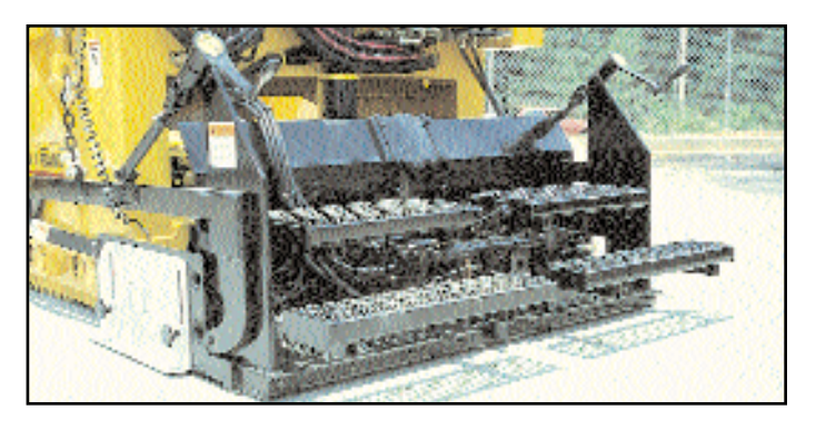
Augers: Two independently operated 8" augers w/ forward and reverse / mounted on extensions. This gives you the ability to retract extension and auger material to the main screed without bending end gate.

Xtend-A-Screed: Free floating 60" x 15" screed / independently operated hydraulic extensions extending 1.5 feet on left and right sides / hydraulically lifted by two 3" cylinders mounted on sides of paver / propane heated w/ two burners / vibratory system is standard operating at 3600 vibrations per minute.