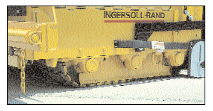
Hydraulic Capacity: 25 gallons w/ tank strainer.

Drive System: Heavy duty servo actuated hydrostatic transmissions w/ auxiliary pump / two fully enclosed heavy duty, self-contained planetary gear boxes / positive direct drive system / two independent, variable speed, hydraulically powered 15" x 49" steel track systems.