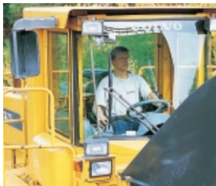
Care Cab II offers unparalleled all-round visibility.

Designed with the operator in mind Once you've comfortably positioned yourself in the multi-adjustable operator's seat, you'll soon discover why Care Cab II provides the best operator environment that money can buy. To your right, the hydraulic lever console can be adjusted to suit any operator. On the console itself, you'll find pilot-operated fingertip hydraulic levers for easy and precise boom/bucket control as well as controls for the APS II shifting system. All instrumentation is right in front of you on the center console of the new wrap-around dashboard. The three piece, silicon bonded front windshield provides excellent visibility to the front, while a new, larger rear window gives you a clear rear view.