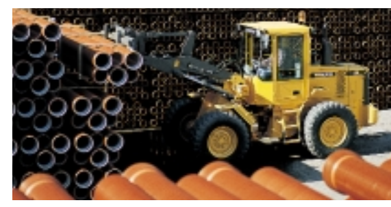
The TP linkage system facilitates long reach and parallel action even at the top.