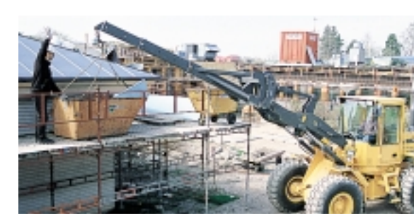
The Volvo material handling arm is perfectly matched to the superior breakout torque and precise control offered by TP-Linkage.