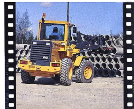
The large, deep, wrap-around windshield gives the operator a clear view of the attachment and wheels. This ensures good visibility over both the machine and the immediate surroundings and makes it possible to work effectively even in close quarters.