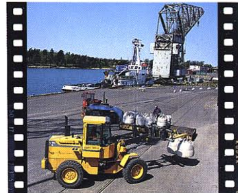
Efficiency is a key feature of the Volvo BML50B. It's designed to move quickly from one work site to another, such as within a harbor area. And with the wide range of attachments and the hydraulic attachment bracket, the L50B can carry out many different kinds of jobs.