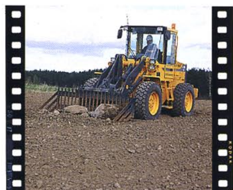
The Volvo BM L50B is not just a loader but a unusually versatile farm machine for larger agricultural operations such as for clearing farmfields with the stone fork.