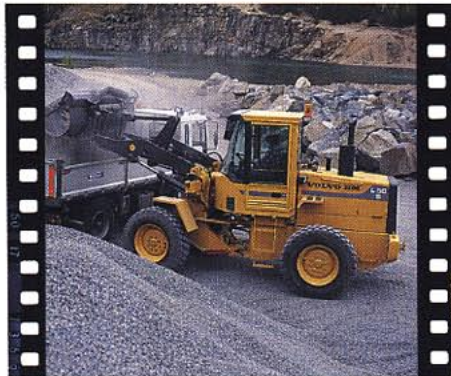
The new TP-linkage makes the Volvo BM L50B a smooth and efficient bucket loader. TP-linkage gives high breakout torque throughout the entire lifting range.

In the photos to the right you'll find some of the different application areas for the new Volvo BM L50B. What more can you ask of a true MultiLoader!