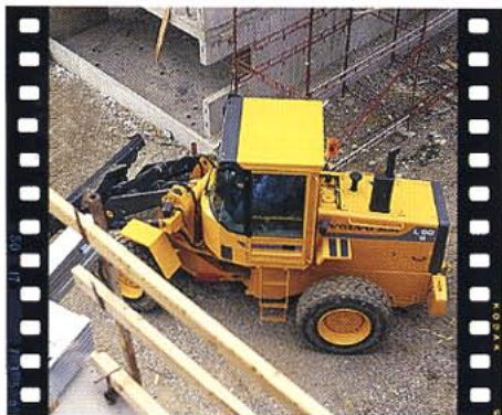
Thanks to the load-sensing steering, you're able to move quickly and smoothly even in hard to reach areas. The Volvo BM L50B is as easy to operate as a car.