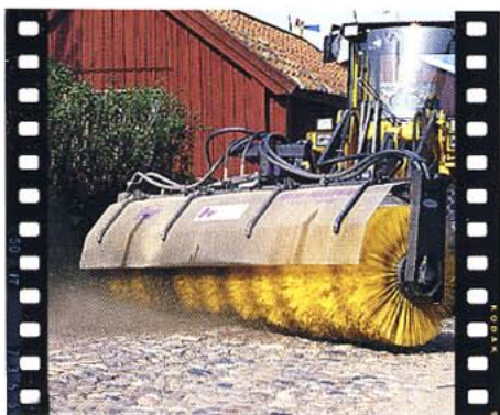
The powerful engine and the effective, hydraulic system provides plenty of power to run various hydraulic attachments such as a sweeper.