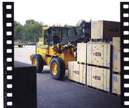
The long reach and good balance due to the long wheel-base enables precise loading even at a distance. The high breakout torque facilitates the handling of heavy material.