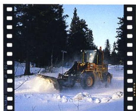
The Volvo BM L50B is powerful enough to plow even up hill. The hydrostatic transmission makes for jerk-free operation and smooth starts; a real advantage on slippery surfaces.