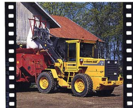
The Volvo BM L50B's wide range of attachments makes it one of the most versatile machines in its class. Here the L50B is equipped with a special attachment for handling large sacks.