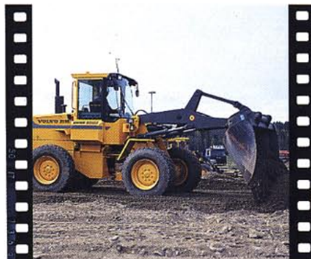
The Volvo BM L50B is ideal for grading work. The bucket can be tilted forward more than 90 degrees, making it possible to grade effectively in both directions. With the help of bucket rolling action it's also possible to pull the machine free if it gets stuck.