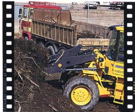
Hard to handle material is no match for the Volvo BM L50B. The unique match of rimpull and breakout torque makes the L50B ideal for municipal projects such as park maintenance etc.