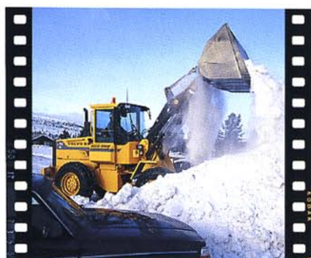
The Volvo BM L50B is a natural for snow clearance. The Care Cab is warm and comfortable and the large windshield gives a good all-round view. Thanks to the load-sensing steering, maneuvering in tight spaces such as on park roads and parking places, is no problem.