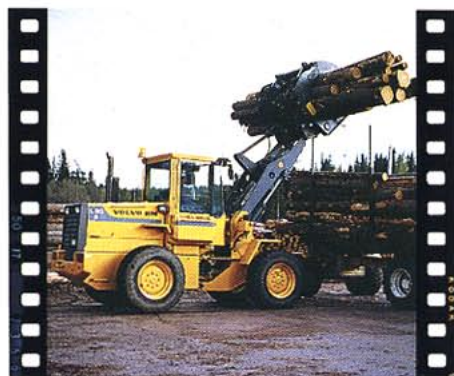
The highly responsive hydraulics and high lifting capability is ideal for timber handling. The small size of the loader and its precise control, where the timber grapple is controlled by the pilot-steered hydraulics, makes the L50B a natural for smaller sawmills.