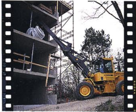
Power, flexibility and hydraulic precision combined with low speed characteristics has clear advantages when working with the material handling arm.