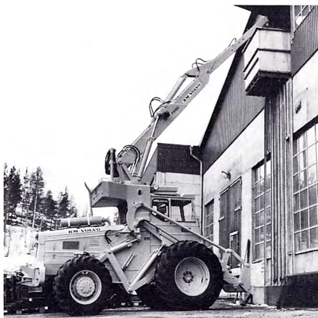
Extension hook for simple material handling.

The 641 crane loader offers unsurpassed versatility the year round owing to its Volvo BM snap-on coupling and wide range of attachments — excavating units, buckets, pallet forks, crane jib, log forks, dozer blades, rotary brooms, grabs, etc.