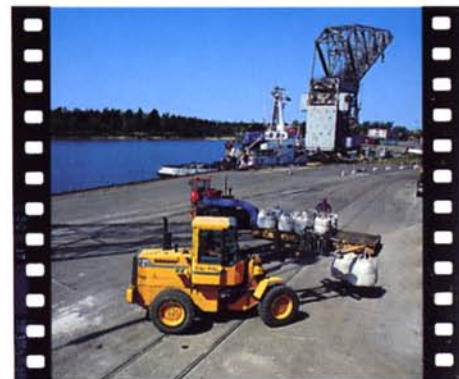
Efficiency is a key feature of the Michigan L50B. It's designed to move quickly from one work site to another, such as within a harbor area. And with the wide range of attachments and the hydraulic attachment bracket, the L50B can carry out many different kinds of jobs.