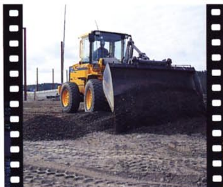
The Michigan L50B is ideal for grading work. The bucket can be tilted forward more than 90 degrees, making it possible to grade effectively in both directions. With the help of bucket rolling action it's also possible to pull the machine free if it gets stuck.