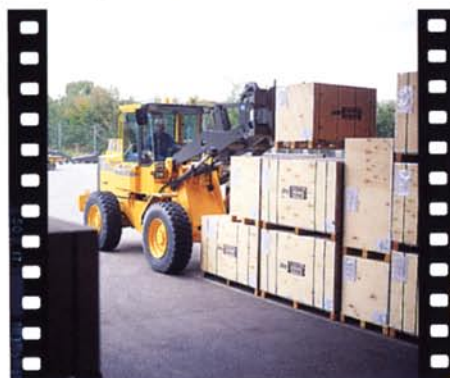
The long reach and good balance due to the long wheel-base enables precise loading even at a distance. The high breakout torque facilitates the handling of heavy material.