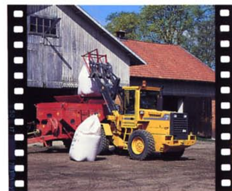
The Michigan L50B's wide range of attachments makes it one of the most versatile machines in its class. Here the L50B is equipped with a special attachment for handling large sacks.