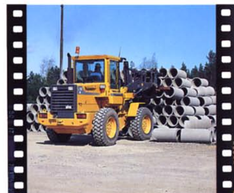
The large, deep, wrap-around windshield gives the operator a clear view of the attachment and wheels. This ensures good visibility over the machine and the immediate surroundings and makes it possible to work effectively even in close quarters.