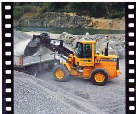
The new TP-linkage makes the Michigan L50B a smooth and efficient bucket loader. TP-linkage gives high breakout torque throughout the entire lifting range.

In the photos to the right you'll find some of the different application areas for the new Michigan L50B. What more can you ask of a true MultiLoader!