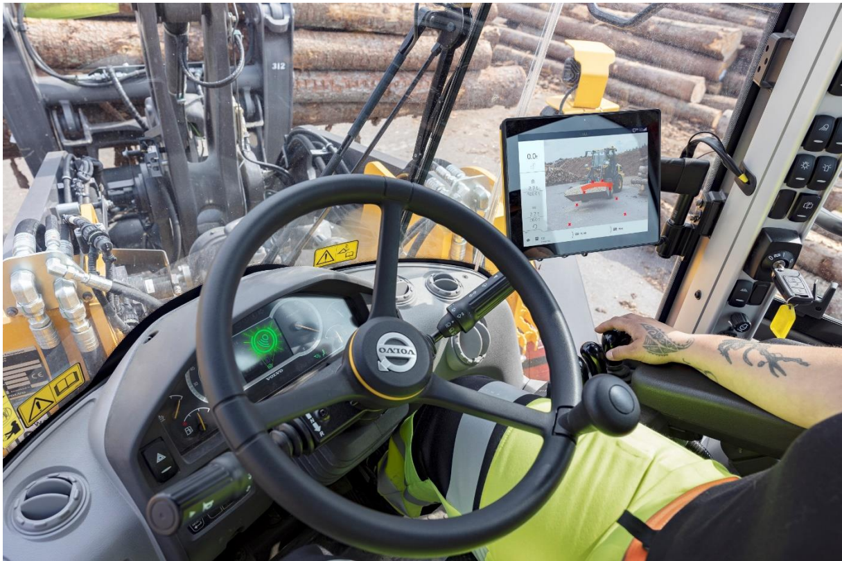
Collision Mitigation System enhances jobsite safety.

It works by identifying when there is a risk of collision and responding by automatically activating the brakes for 2-3 seconds to slow the machine down prior to impact or bring it to a stop to avoid it. This initiation of the braking alerts the operator to intervene.