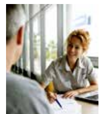
Volvo Financial Services