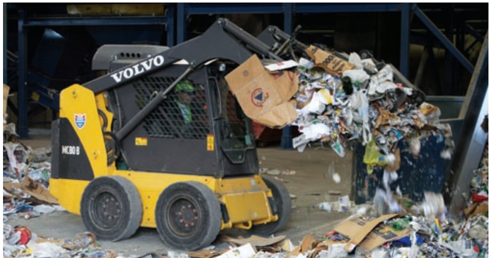
The Volvo MC80B skid steer loader starts all waste sorting activity at the MRF by gradually dumping waste onto the in-feed conveyor.

February 2008, Penn Waste’s MRF recycles and sorts single-stream household waste – paper, cardboard, glass, metals and plastics. For about six years, the company has operated a commingled waste facility – which sorts metals, glass and plastics, but not paper or cardboard – on the same site as the MRF.