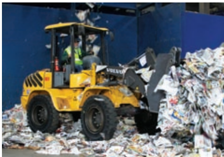
The Volvo L30B Pro compact loader gets into tight places easily.

The new state-of-the-art facility is an unqualified success. In operation since