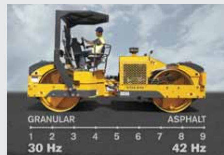
Nine selectable frequencies