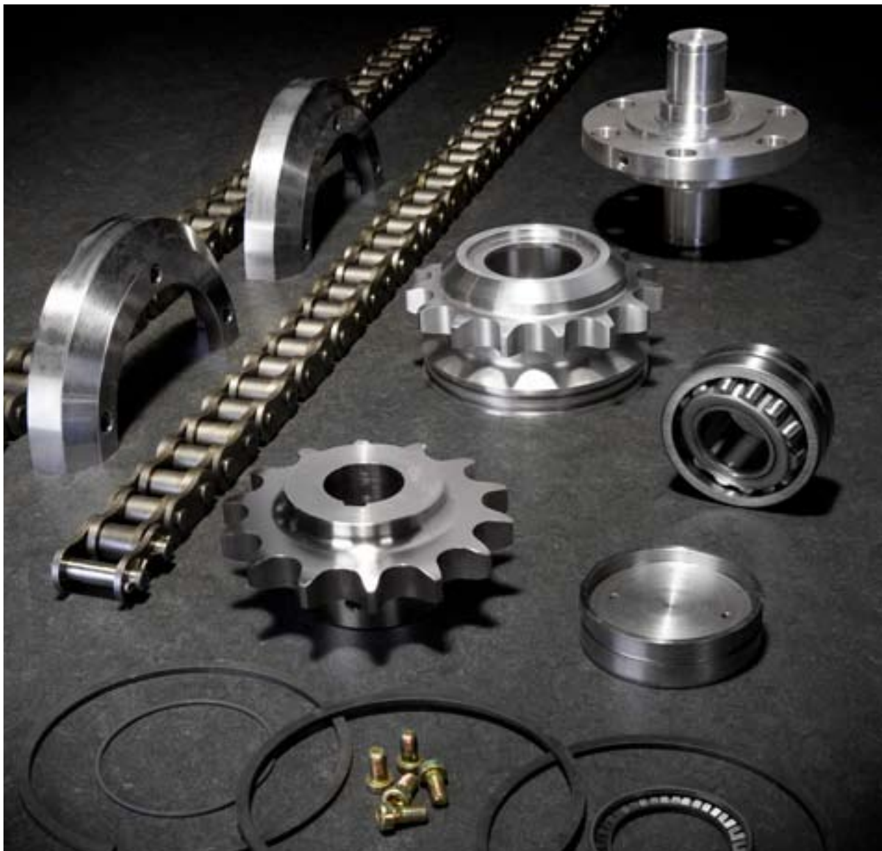
Auger drive kit