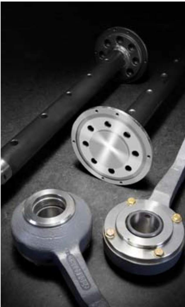
Auger shaft kit