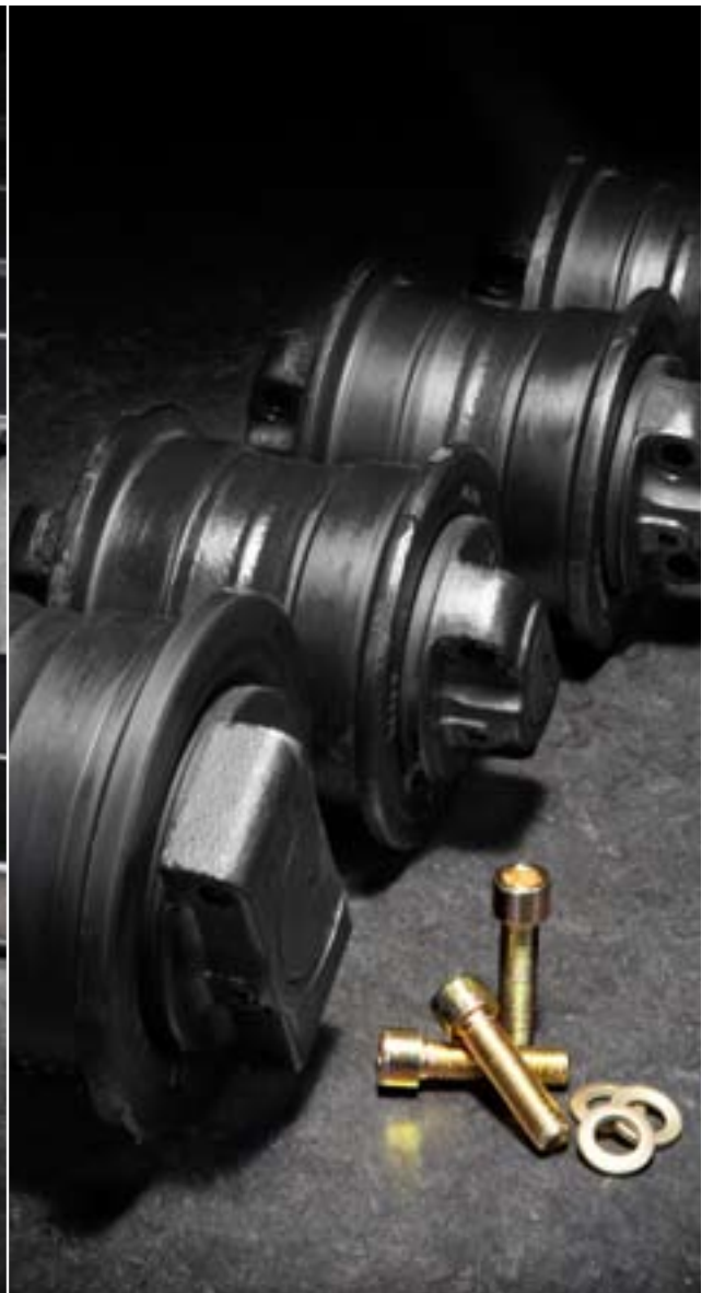
Undercarriage roller kit