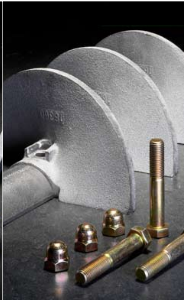
Auger flight kit