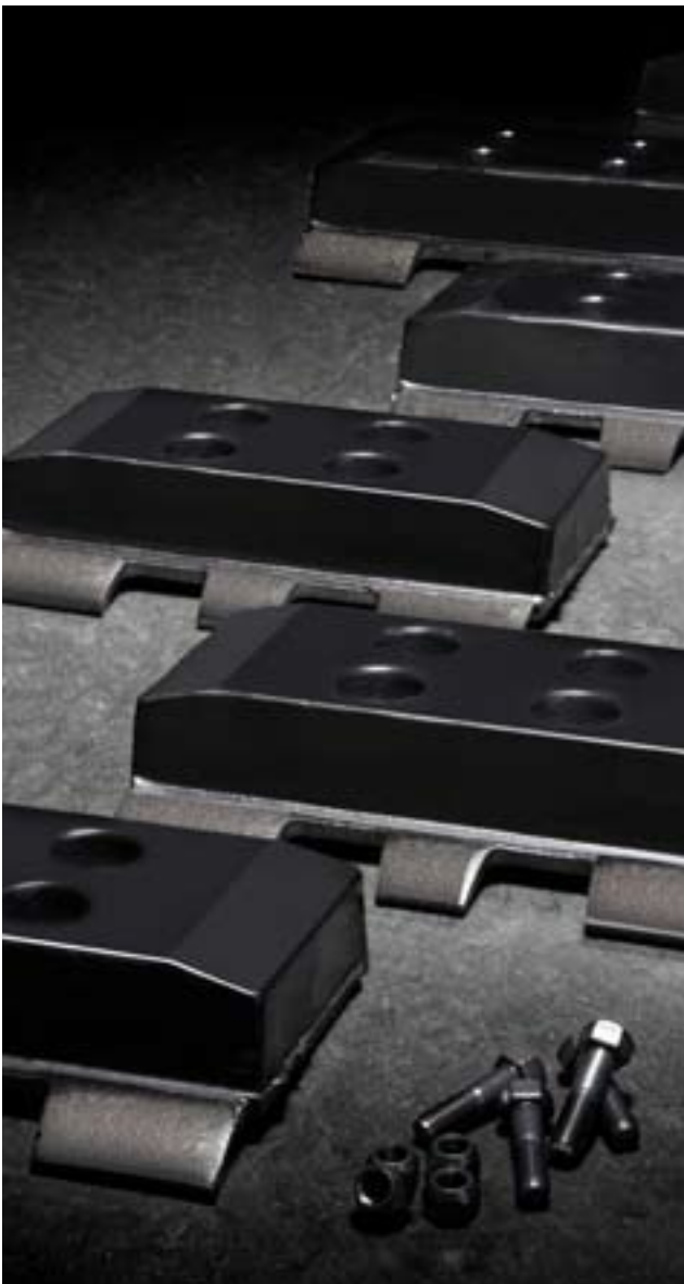
Rubber track pads kit