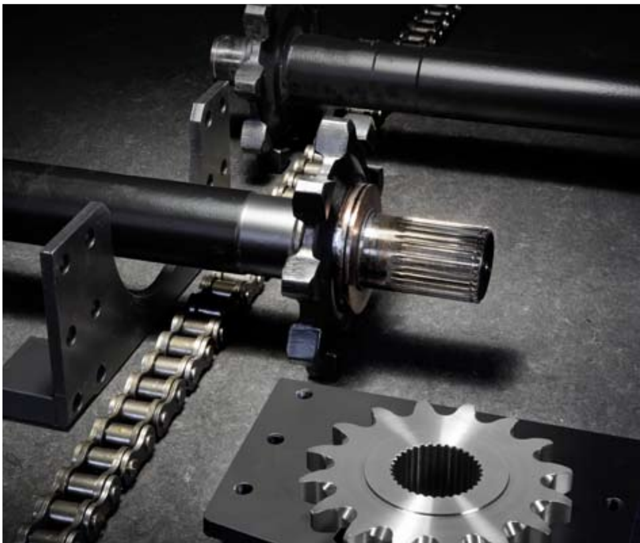
Conveyor drive kit