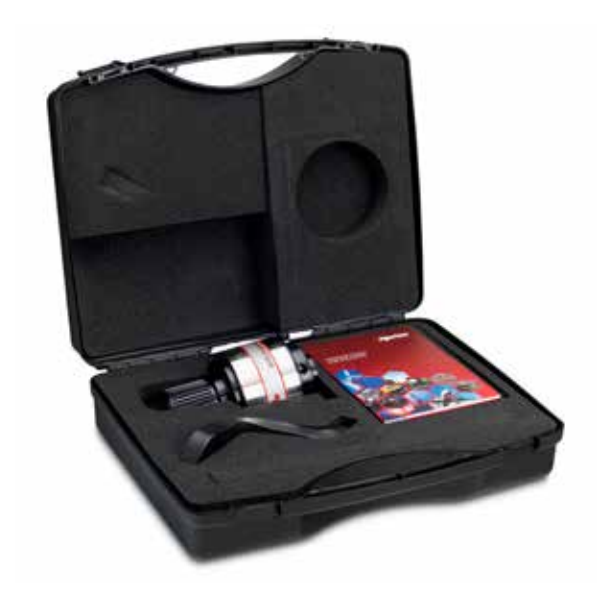
TORQUE MULTIPLIER - 1/2 IN TO 1 IN DRIVE Part No. 15269866