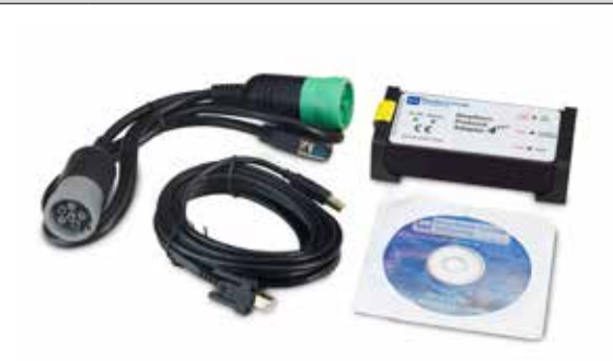
DOC VEHICLE INTERFACE KIT Part No. 15502615