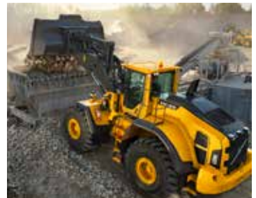
Volvo Construction Equipment