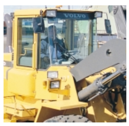
Care Cab II offers unparalleled all-round visibility.

Designed with the operator in mind Once you've comfortably positioned vourself in the multi-adjustable operator's seat, you'll soon discover why Care Cab II provides the best operator environment that money can buy. To your right, the hydraulic lever console can be adjusted to suit any operator. On the console itself, you'll find pilotoperated fingertip hydraulic levers for easy and precise boom/bucket control as well as controls for the APS II shifting system. All instrumentation is right in front of you on the center console of the new wrap-around dashboard. The three piece, silicon bonded front windshield provides excellent visibility to the front, while a new, larger rear window gives you a clear rear view.