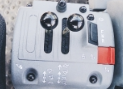
Pilot operated fingertip hydraulic levers provide easy control of the hydraulic functions. The adjustable hydraulic lever console also features a rocker switch for foward/reverse shifting and 1<sup>st</sup> gear kickdown button.

Middle/right: Forward, reverse or kickdown – APS II shifting can be controlled with the shift lever, rocker switch on the hydraulic console or the CDC armrest**.