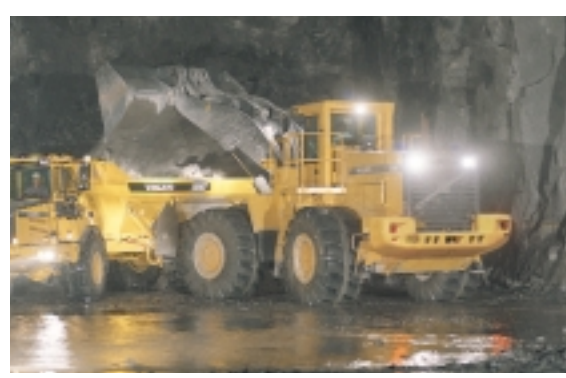
Built for the toughest jobs – above or below