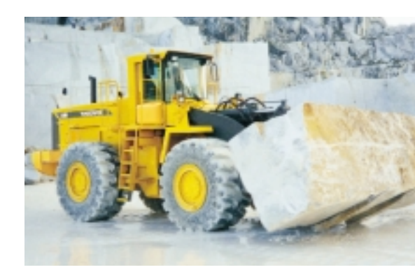
In carrying applications such as block handling, the L330D's load-sensing hydraulics allow more engine power to the drivetrain for fast transport cycles.

At Volvo, we've always believed that power by itself will only get you halfway. That's why we've focused on developing efficient drivetrains and hydraulic systems, permitting the power of the L330D to be turned into record-breaking productivity. Try out the new L330D for yourself, and see why muscles and brains are such an unbeatable combination.