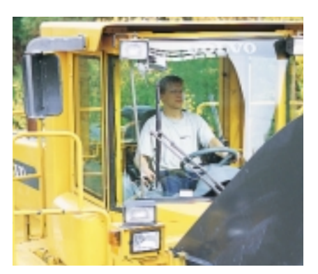
Care Cab II offers unparalleled all-round visibility.

Designed with the operator in mind Once you've comfortably positioned yourself in the multi-adjustable operator's seat, you'll soon discover why Care Cab II provides the best operator environment that money can buy. To your right, the hydraulic lever console can be adjusted to suit any operator. On the console itself, you'll find pilotoperated fingertip hydraulic levers for easy and precise boom/bucket control as well as controls for the APS II shifting system. All instrumentation is right in front of you on the center console of the new wrap-around dashboard. The three piece, silicon bonded front windshield provides excellent visibility to the front, while a new, larger rear window gives you a clear view.