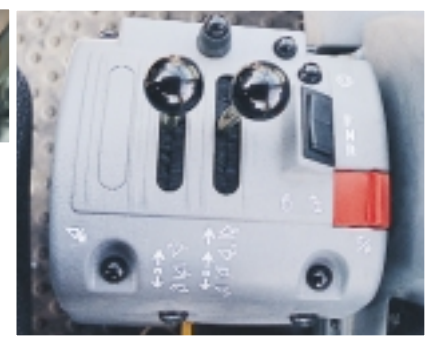
Pilot operated fingertip hydraulic levers provide easy control of the hydraulic functions. The adjustable hydraulic lever console also features a rocker switch for foward/reverse shifting and a 1st gear kickdown button.

A full range of productivity boosting options, including Comfort Drive