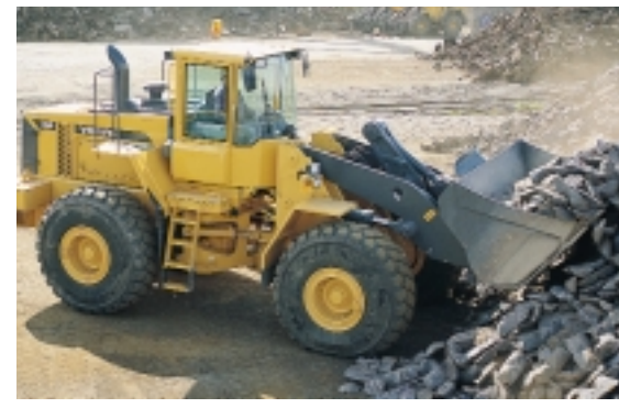
The well-matched drivetrain allows for ample rimpull and excellent hydraulic power for all loading applications.