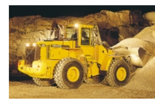
TP linkage, together with Volvo designed buckets, gives the maximum bucket fill factor on the market today.

The true strength of the L150D and L180D can be traced directly to their well-matched, Volvo-built drivetrains and hydraulic systems, all working together to provide the optimum balance of power between the wheels and the working hydraulics. The transmission also features four forward and four reverse gears allowing for even more agility in tight applications.