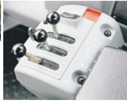
Pilot operated fingertip hydraulic levers provide easy control of the hydraulic functions. The adjustable hydraulic lever console also features a rocker switch for foward/reverse shifting and a 1st gear kickdown button.

Middle/right: Forward, reverse or kickdown – APS II shifting can be controlled with the shift lever, rocker switch on the hydraulic console or the CDC armrest**.