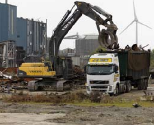
• Quick cycles for grasping and loading.