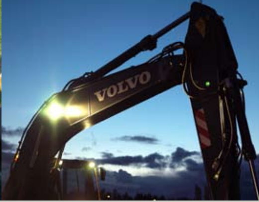
• Trust Volvo for performance and support.