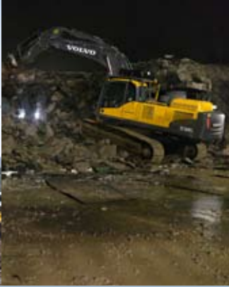
• Stability on uneven ground.