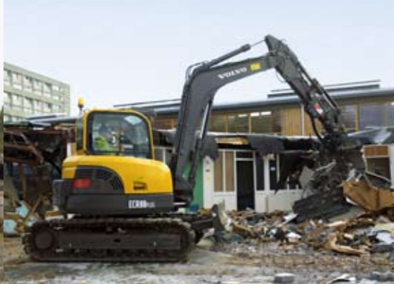
• Volvo has complete demolition equipment solutions.