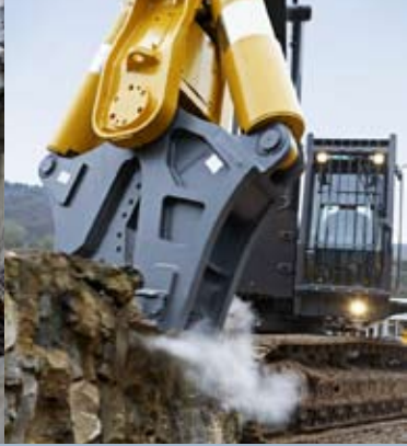
• Strong tear-out forces.