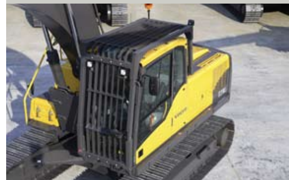
• Frame-mounted FOG protects the operator.