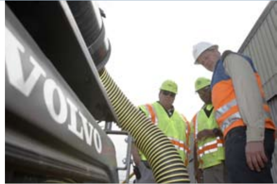
• Customers rely on Volvo for equipment — and more.

For demolition contractors, having great iron is only part of the equation for success on the job site. Customers want more than a machine. They want support. They want solutions. They need to know their equipment — and their brand — will be there. They need to know Volvo.