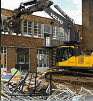
• Control to work in tight spaces.