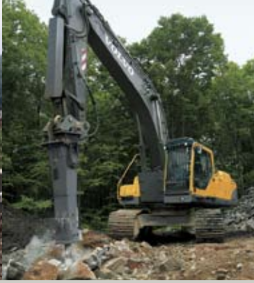
• Demolition attachment performance.