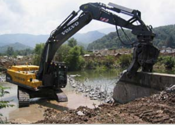
• Power and quick cycles for demolition.