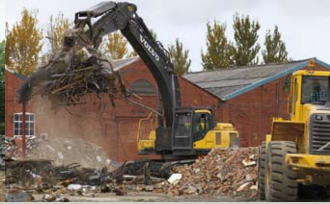
• Demolition excavators, wheel loaders — and more.