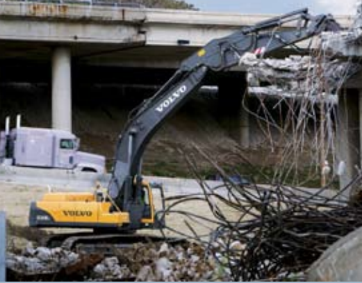
• Volvo delivers reach and attachment power.