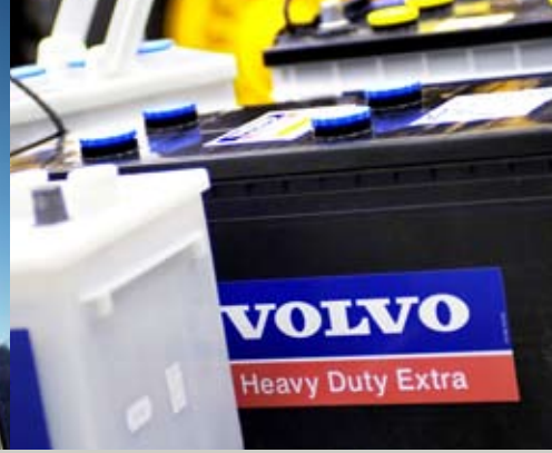
• High-performance parts for long machine life.