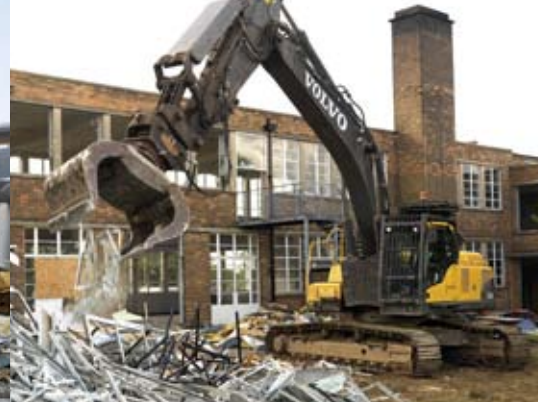
• Harmonized hydraulics for lifting and swinging.