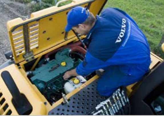
• Experienced field technicians keep you working.