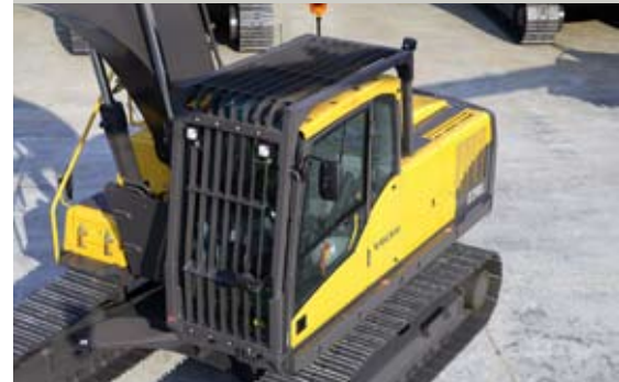
• Frame-mounted FOG protects the operator.