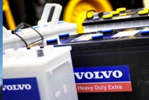
• High-performance parts for long machine life.