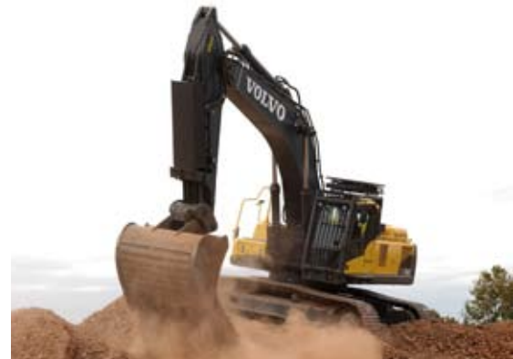
• Stability for compacting and digging debris.