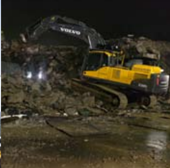
• Stability on uneven ground.