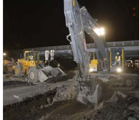
• Performance for site remediation.