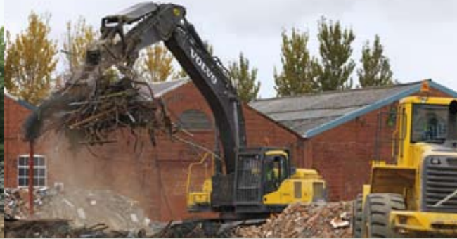
• Demolition excavators, wheel loaders — and more.