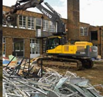
• Control to work in tight spaces.