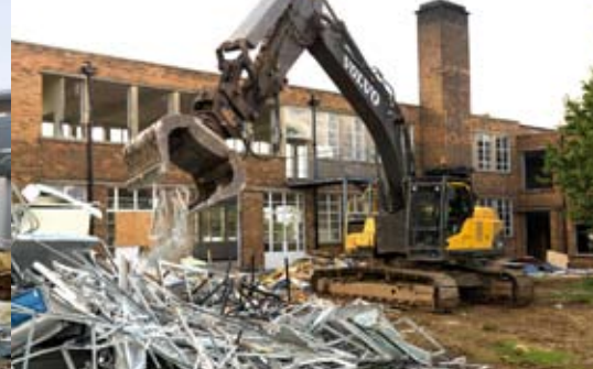
• Harmonized hydraulics for lifting and swinging.