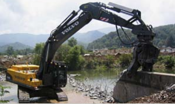
• Power and quick cycles for demolition.