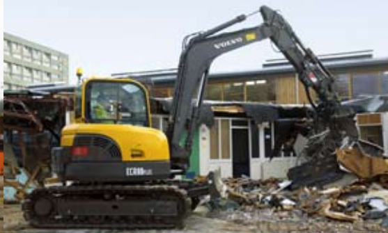
• Volvo has complete demolition equipment solutions.