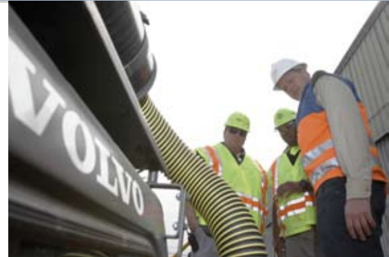
• Customers rely on Volvo for equipment — and more.

For demolition contractors, having great iron is only part of the equation for success on the job site. Customers want more than a machine. They want support. They want solutions. They need to know their equipment — and their brand — will be there. They need to know Volvo.