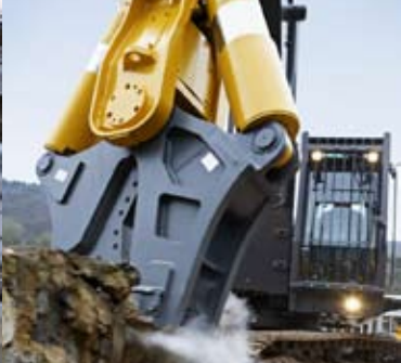
• Strong tear-out forces.