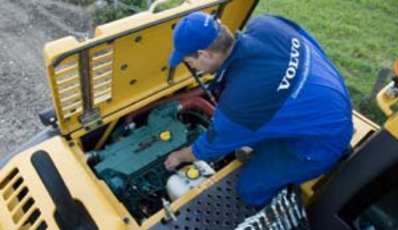
• Experienced field technicians keep you working.