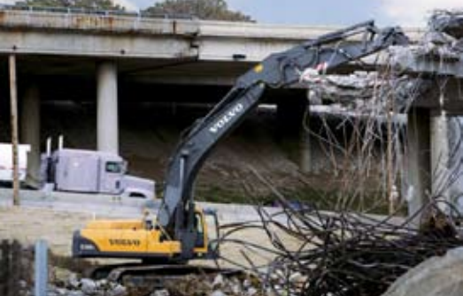
• Volvo delivers reach and attachment power.