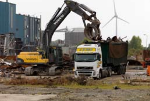
• Quick cycles for grasping and loading.