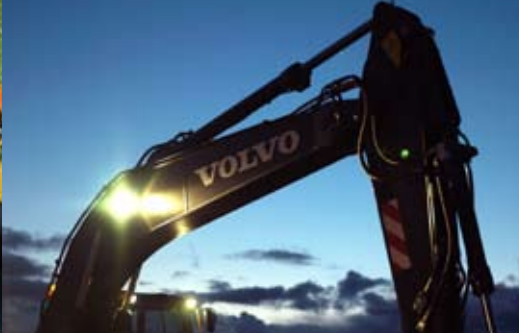
• Trust Volvo for performance and support.