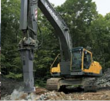
• Demolition attachment performance.