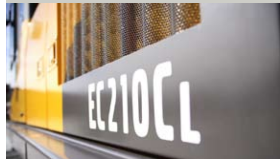
• Micro mesh screens keep particles from coolers.