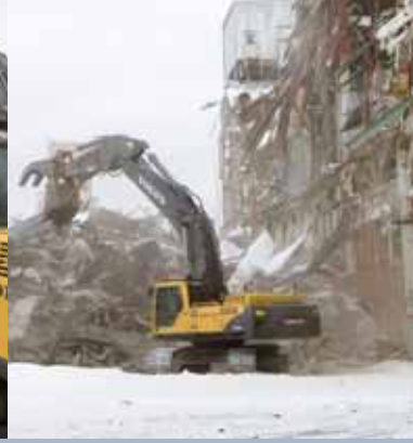
• Control to work in tight spaces.