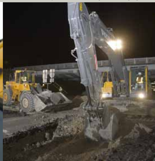
• Performance for site remediation.