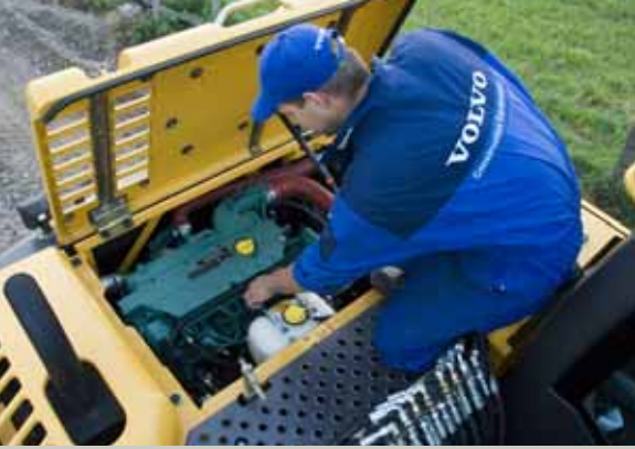
• Experienced field technicians keep you working.