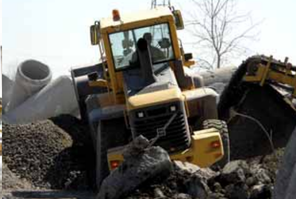
• Volvo has complete demolition equipment solutions.