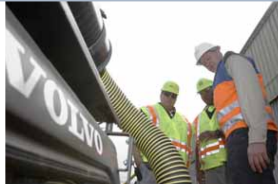
• Customers rely on Volvo for equipment — and more.

For demolition contractors, having great iron is only part of the equation for success on the job site. Customers want more than a machine. They want support. They want solutions. They need to know their equipment — and their brand — will be there. They need to know Volvo.