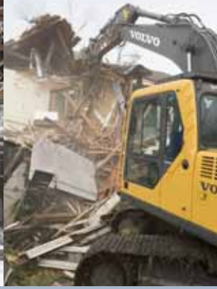
• Stability on uneven ground.