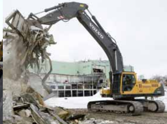
• Harmonized hydraulics for lifting and swinging.