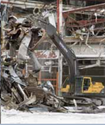
• Strong tear-out forces.