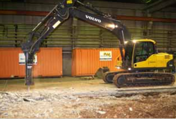
• Power and quick cycles for demolition.