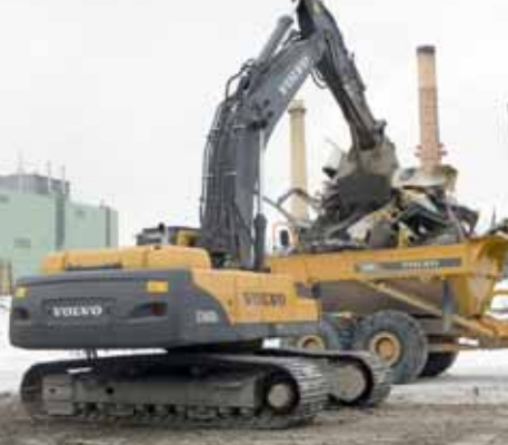
• Quick cycles for grasping and loading.