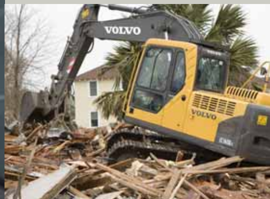
• Stability for compacting and digging debris.