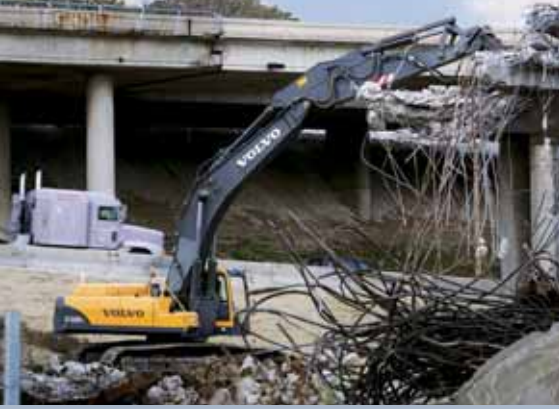
• Volvo delivers reach and attachment power.