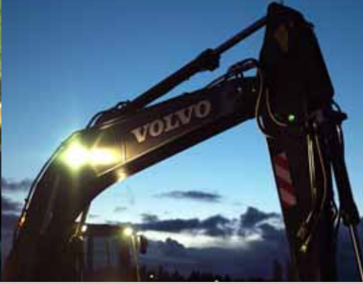
• Trust Volvo for performance and support.