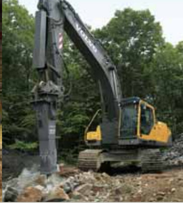
• Demolition attachment performance.