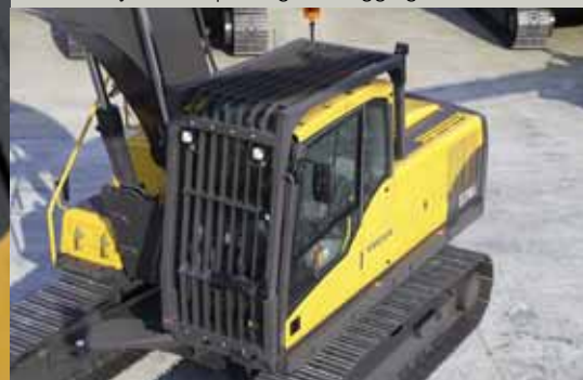
• Frame-mounted FOG protects the operator.