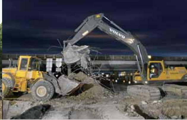
• Demolition excavators, wheel loaders — and more.