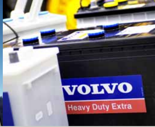
• High-performance parts for long machine life.