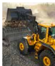
Volvo Construction Equipment