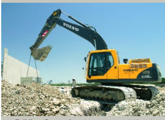
Full line: Range of machine sizes match the job