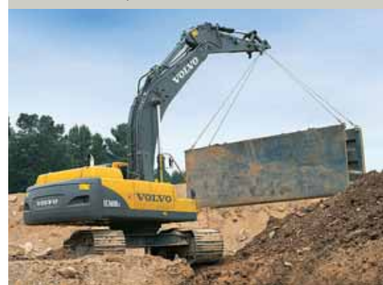
Control: Smooth hydraulics for precision placing