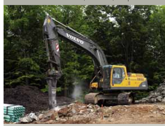
Power: Easily lift trench boxes or manholes