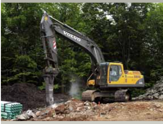
Power: Easily lift trench boxes or manholes