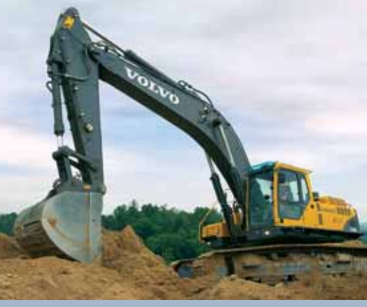
Quick swing: Allows for efficient backfilling

Smooth movement: Level and compact easily