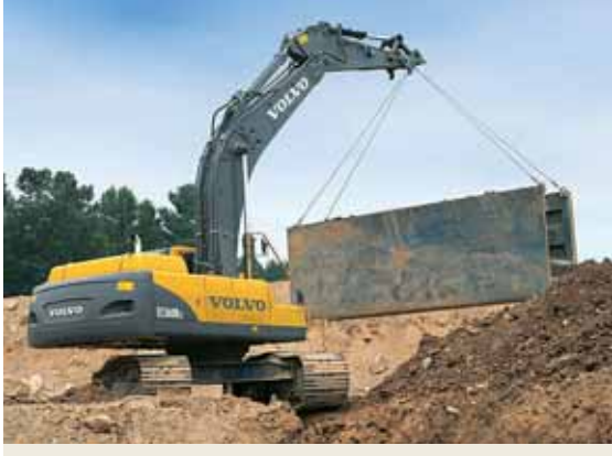
Control: Smooth hydraulics for precision placing