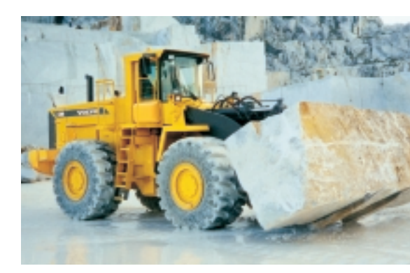
In carrying applications such as block handling, the L330D's load-sensing hydraulics allow more engine power to the drivetrain for fast transport cycles.

At Volvo, we've always believed that power by itself will only get you halfway. That's why we've focused on developing efficient drivetrains and hydraulic systems, permitting the power of the L330D to be turned into record-breaking productivity. Try out the new L330D for yourself, and see why muscles and brains are such an unbeatable combination.