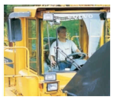
Care Cab II offers unparalleled all-round visibility.

Designed with the operator in mind Once you've comfortably positioned yourself in the multi-adjustable operator's seat, you'll soon discover why Care Cab II provides the best operator environment that money can buy. To your right, the hydraulic lever console can be adjusted to suit any operator. On the console itself, you'll find pilotoperated fingertip hydraulic levers for easy and precise boom/bucket control as well as controls for the APS II shifting system. All instrumentation is right in front of you on the center console of the new wrap-around dashboard. The three piece, silicon bonded front windshield provides excellent visibility to the front, while a new, larger rear window gives you a clear rear view.