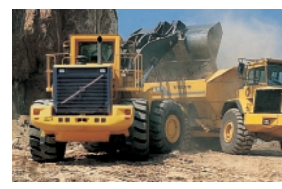
Although it's a big loader, you'll find the L330D is both quick and agile.