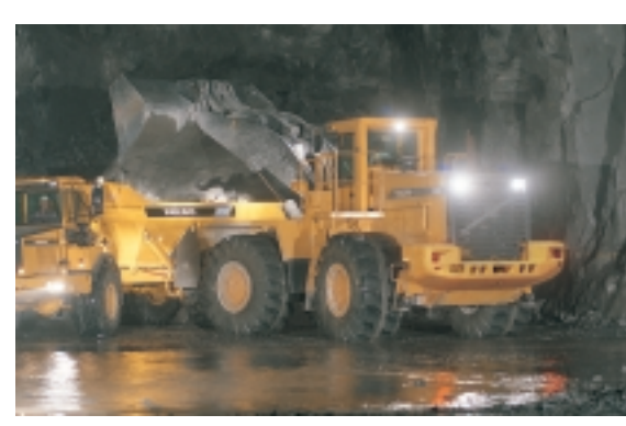
Built for the toughest jobs – above or below ground.