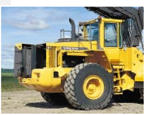
Openable engine access doors with gas struts and swing-out radiator grille and radiator simplify service and cleaning.