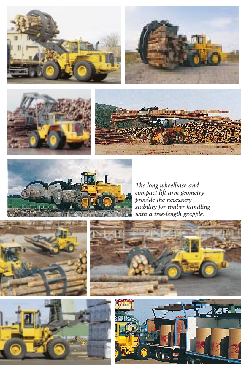
A small turning radius and exact, load-sensing steering facilitate work in confined spaces.