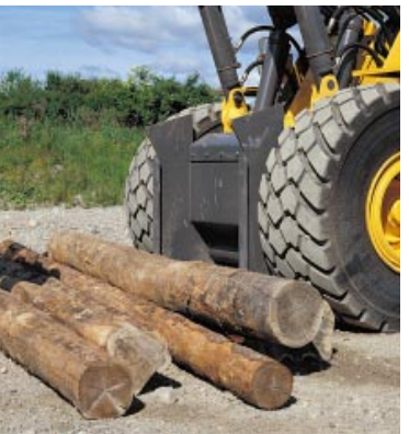
With log pusher and kick-out you can build higher stacks and utilize the storage space on the wood yard more efficiently.

8,5 tonnes working load, 5,5 m lift height under suspended load and 4 m reach is the most powerful machine for saw timber and pulpwood we have ever built. The loader unit is controlled with speed and precision by means of a pilotoperated hydraulic system. The grapples can be rotated 360°, enabling the Volvo L180D High-Lift to get at the timber from all sides of the stack. This in turn permits more rational turnover of the timber stock, shortens the cycle time and boosts productivity. By utilizing the High-Lift's maximum lift height for stacking, it is possible to use the wood yard 30-40 percent more efficiently than is normal.