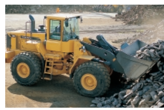
The well-matched drivetrain allows for ample rimpull and excellent hydraulic power for all loading applications.