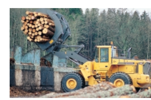
TP linkage comes into its own in timber applications. No other system provides such high breakout torque throughout the lift cycle.