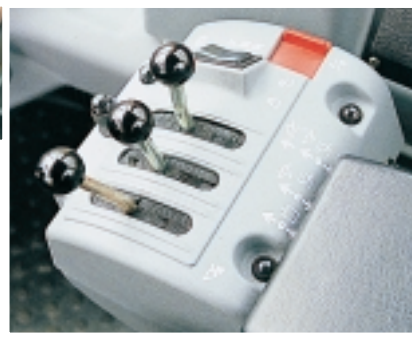
Pilot-operated fingertip hydraulic levers provide easy control of the hydraulic functions. The adjustable hydraulic lever console also features a rocker switch for foward/reverse shifting and a 1<sup>st</sup> gear kickdown button.

Middle/right: Forward, reverse or kickdown – APS II shifting can be controlled with the shift lever, rocker switch on the hydraulic console or the CDC armrest**.