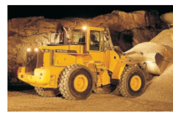
TP linkage, together with Volvo-designed buckets, gives the maximum bucket fill factor on the market today.

The true strength of the L150D and the L180D can be traced directly to their well-matched, Volvo-built drive-trains and hydraulic systems, working together to provide the optimum balance of power between the wheels and the working hydraulics. The transmission also features four forward and four reverse gears, allowing for even more agility in tight applications.