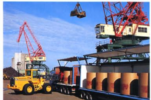
The L90B is an easy-to-manoeuvre materials handler for high-capacity work and heavy loads in harbours and in industrial applications.

With the optional Boom Suspension System, the rocking tendencies at high speeds are eliminated regardless of load. This further boosts work capacity, operating safety and comfort.