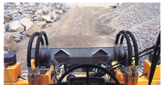
The new, curved windshield provides panoramic visibility over the work site.

As you can see, the Care Cab does justice to its name.