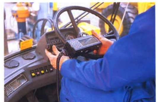
The Contronic system allows for quick service diagnosis. The system collects data from a number of analog sensors. Quicker troubleshooting gives shorter down time.

Contronic simplifies maintenance and thereby can help to reduce maintenance and repair costs.