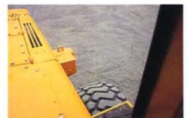
Excellent rear visibility enables the operator to see both the counterweight and the rear wheels.