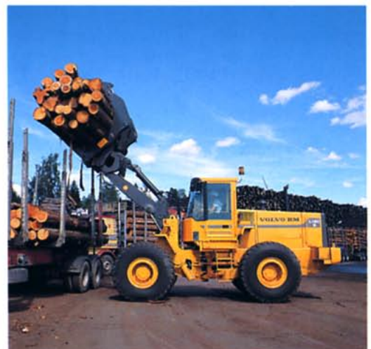
Generous breakout torque, reach and lift height make it easy to handle heavy loads even in the top position.

The new, load-sensing steering system allows precise steering regardless of load, engine speed and driving surface. The system saves energy and makes the machine easy to manoeuvre even in difficult terrain.