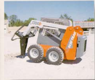
Ideal for landscape, construction and material handling applications.