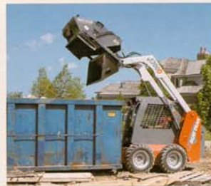
Standard 16.4 GPM hydraulic pump provides plenty of power for optional attachments.