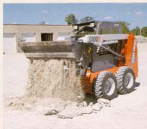
Incorporates rugged components proven in larger SCAT TRAK models.