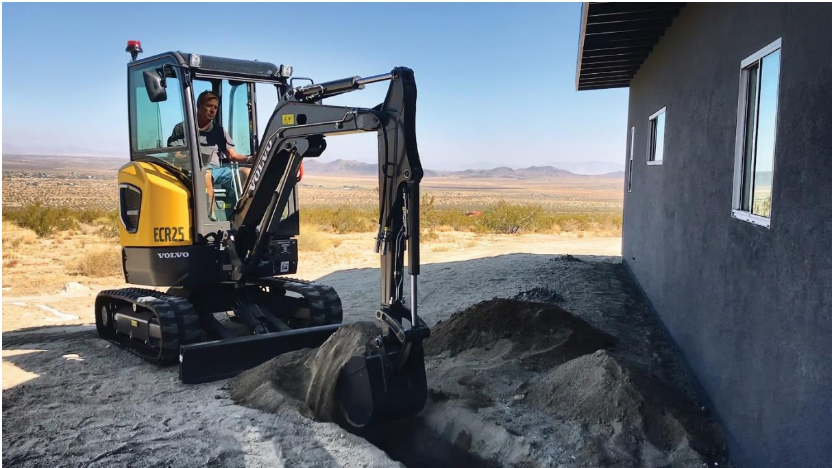
The ECR25 Electric in operation for customer Baltic Sands in California

Another US customer Baltic Sands specializes in environmentally sensitive, luxury off-grid property development and real estate, developing homes with a focus on sustainability and unique design enhanced by the surrounding environment. The company primarily works in remote desert locations where power, water and utilities aren't simply scarce — they're nonexistent.