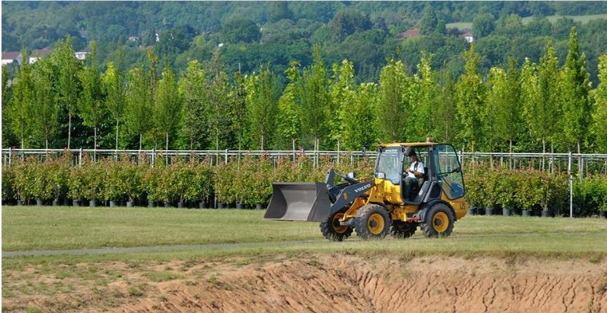
The L25 Electric working on the farm for Leick Baumschulen in Konz

In addition, the lack of fumes and low vibrations provided by these electric machines make them perfect for all other kinds of landscaping and agricultural work. For customer Leick Baumschulen in Konz, Germany, for example, the L25 Electric wheel loader has proved an instrumental tool in transporting plants and trees and other maintenance work such as pallet handling, loading material, grading and sweeping.