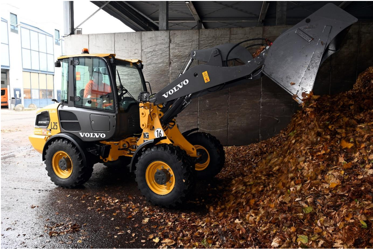
The L25 Electric working for Berliner Stadtreinigung in Berlin

So reliable have these electric wheel loaders proved to be that another customer Berliner Stadtreinigung ordered a fleet of nine Volvo L25 Electric wheel loaders to help them meet their climate protection goals across several sites in the Berlin metropolitan area in Germany. They help the city keep its streets and sidewalks clean and clear, pushing waste from the city's 26,000 garbage bins into boxes and transferring the waste to compacting containers. In the winter, the machines are also helping with the important role of keeping Berlin's roads free of snow and ice, loading de-icing salt and gravel for the city's grit spreaders.